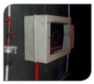
Figure 2 - VESDA VLI in protective enclosure

Technicians will likely take more interest in working on a detector that is free from dirt, dust or other external contaminants. Dirty detectors can also allow contaminates to enter the ports if and when pipes are removed.